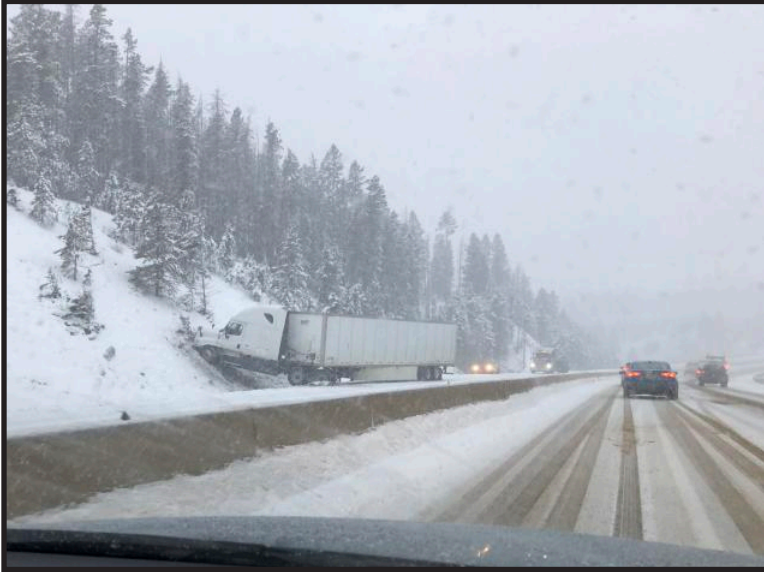
Beautiful Winter Wonderland scenery Homestake Pass on I-90 east of Butte, MT

THOSE WHO ARE FOOLISH AND THOSE WHO APPROVE THEIR WORDS THINK THAT THEY WILL LIVE ON EARTH FOREVER