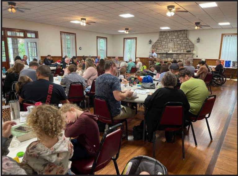
Some of the “crowd” at the PA Family Camp Christ Church Everett, PA

“This figure of speech [about the shepherd entering by the door of the sheep-fold] Jesus spoke to them, but they did not understand what those things were which He had been saying to them.”