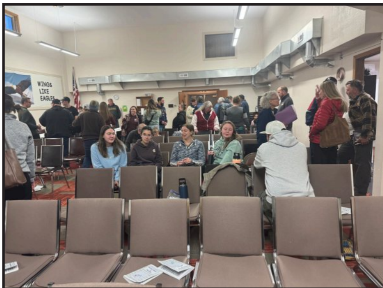
Saints hanging around and visiting following lesson Wednesday evening assembly Christ's Church in Great Falls, MT

“I know that the LORD will maintain the cause of the afflicted And justice for the poor. Surely the righteous will give thanks to Your name; The upright will dwell in Your presence.” -- Psalm 18:10,11