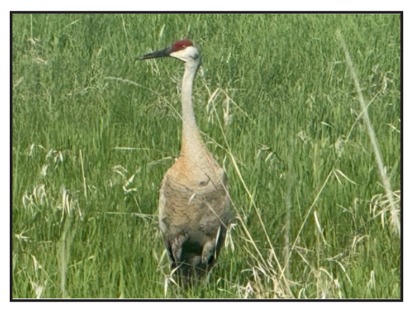
Sandhill Crane, lord of its domain north of the Bozeman church building on Spain Bridge Road Christ's Church in Bozeman, MT

The LORD said to [Rachel], "Two nations are in your womb; And two peoples will be separated from your body; And one people shall be stronger than the other; And the older shall serve the younger." -- (of Jacob and Esau) Genesis 25:23