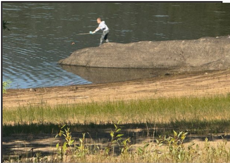
Boy fishing in Delmoe Reservoir Men's Peaks 2025 near Butte, MT

“The things which you have heard from me in the presence of many witnesses, entrust these to faithful men who will be able to teach others also.”