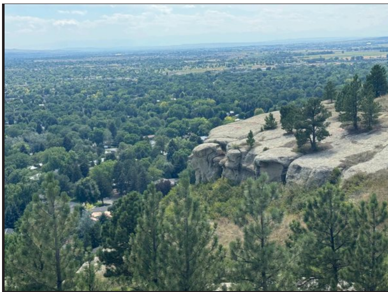
W. Billings and the Yellowstone River valley seen from the rim west of the Billings airport

“The Mighty One, God, the LORD, has spoken, And summoned the earth from the rising of the sun to its setting. Out of Zion, the perfection of beauty, God has shone forth.” -- Psalm 50:1,2