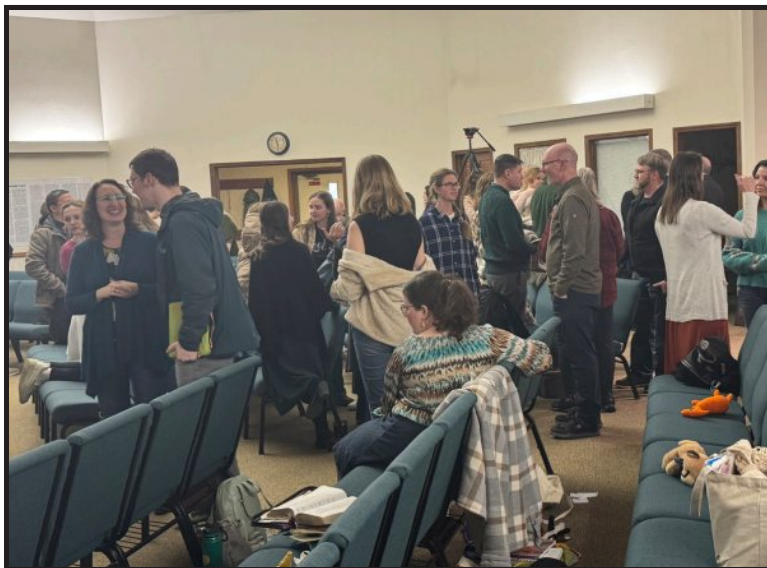
Brethren hanging around and fellowshiping following Lord's Day morning assembly Christ's Church in Bozeman

“For while we were still helpless, at the right time Christ died for the ungodly. For one will hardly die for a righteous man; though perhaps for the good man someone would dare even to die. But God demonstrates His own love toward us, in that while we were yet sinners, Christ died for us.”